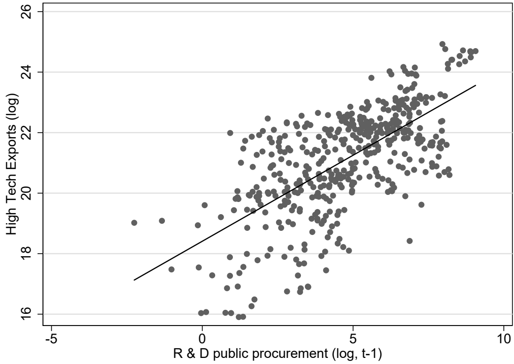
Figure 2: Scatter plot of high-tech exports and R&D public procurement

Notes: The fitted line shows a log-linear relationship between the lagged R&D public procurement and High-tech exports in 50 US states and DC in the period 2000–2008. High-tech exports are state amount in (billions of constant USD, the base year 2000). R&D public procurement is state amount in (billions of constant USD, the base year 2000).