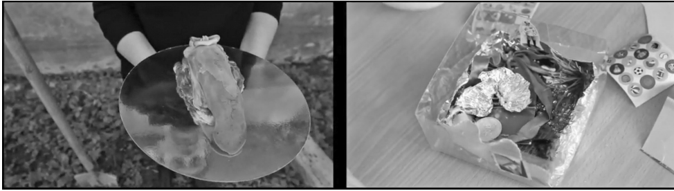
Figure 11.1 Antonina Slobodchikova, frame from The Vote to the Ground , 2012. Ashes to Ashes ( Golos Zemle. Prah k Prabu ), 2012. Two-channel video, cinematographer Tanya Haurylchyk.