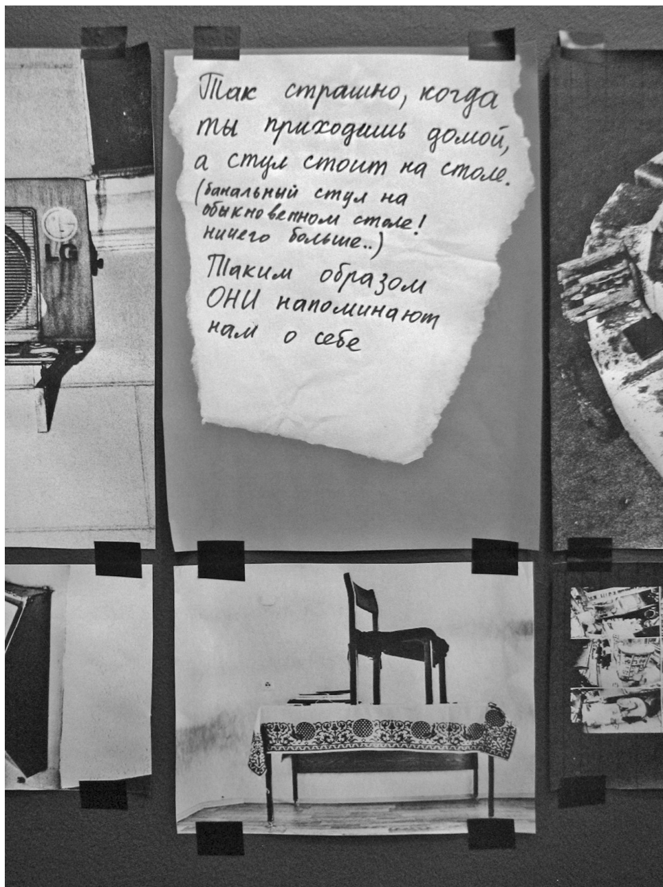
Figure 11.4 Sergey Shabohin, Practices of Subordination , 2011. Y Gallery pavilion: She Cannot Say Heaven , the main program of the festival Artvilnius'11 , Lithuanian Art Gallerists' Association, Vilnius, Lithuania.