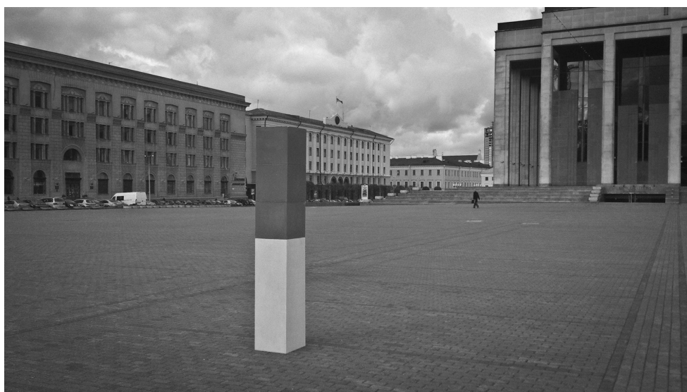
Figure 11.3 Mikhail Gulin, Personal Monument , 2012.