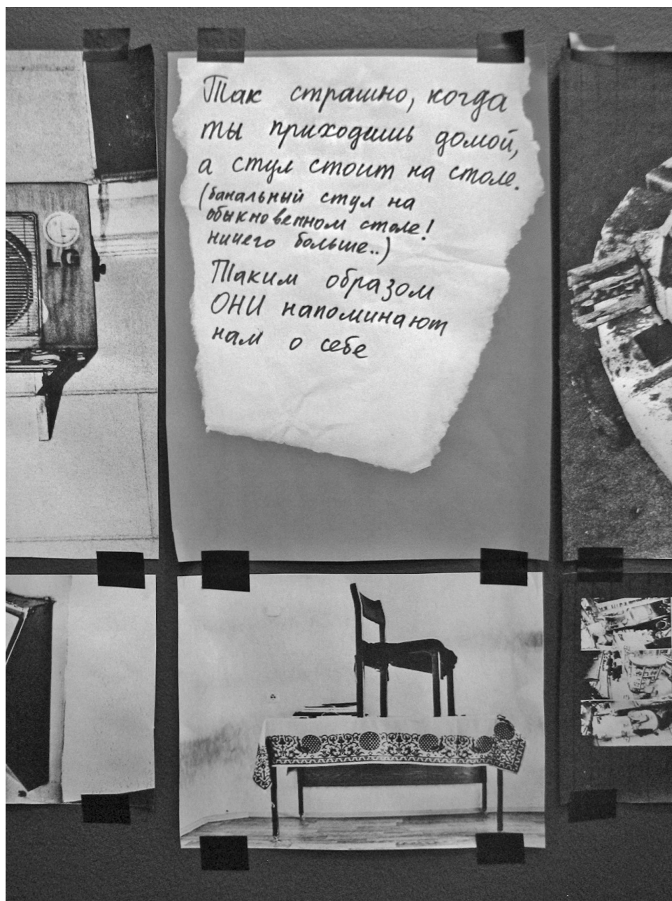
Figure 11.4 Sergey Shabohin, Practices of Subordination , 2011. Y Gallery pavilion: She Cannot Say Heaven , the main program of the festival Artvilnius'11 , Lithuanian Art Gallerists' Association, Vilnius, Lithuania. Photograph © Sergey Shabohin.