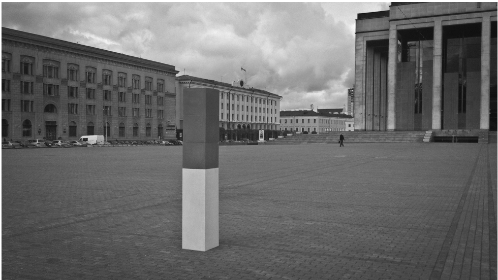
Figure 11.3 Mikhail Gulin, Personal Monument , 2012.