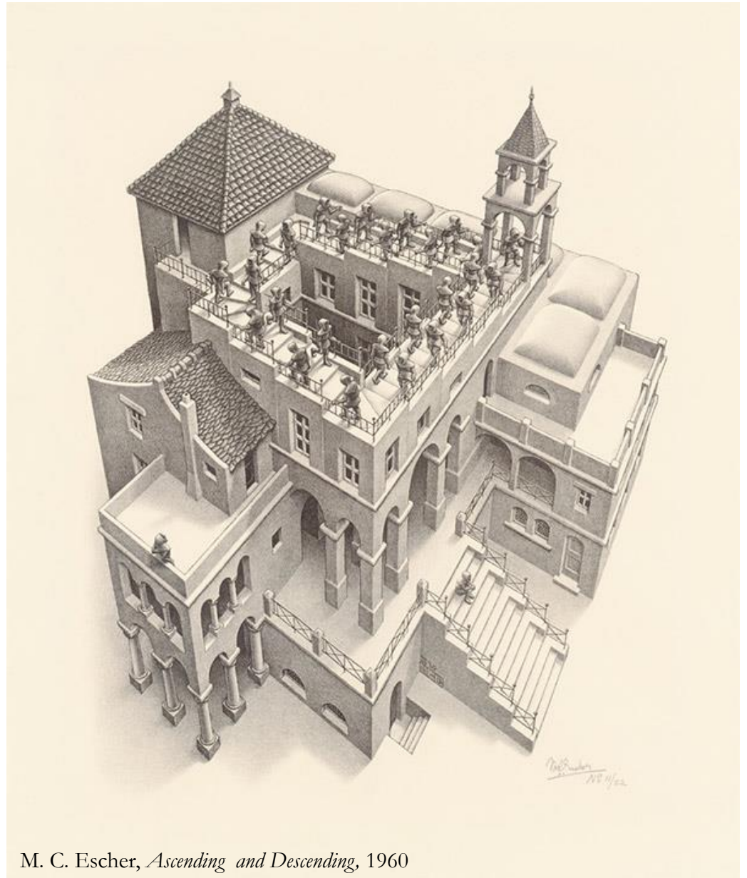
M. C. Escher, Ascending and Descending , 1960