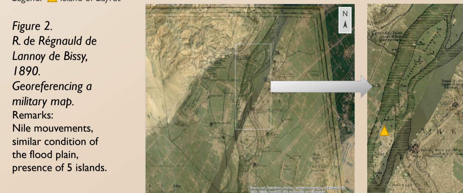
Figure 2. R. de Régnaud de Lannoy de Bissy, 1890. Georeferencing a military map.

Remarks: Nile movements, presence of 5 islands, flood plain environment.