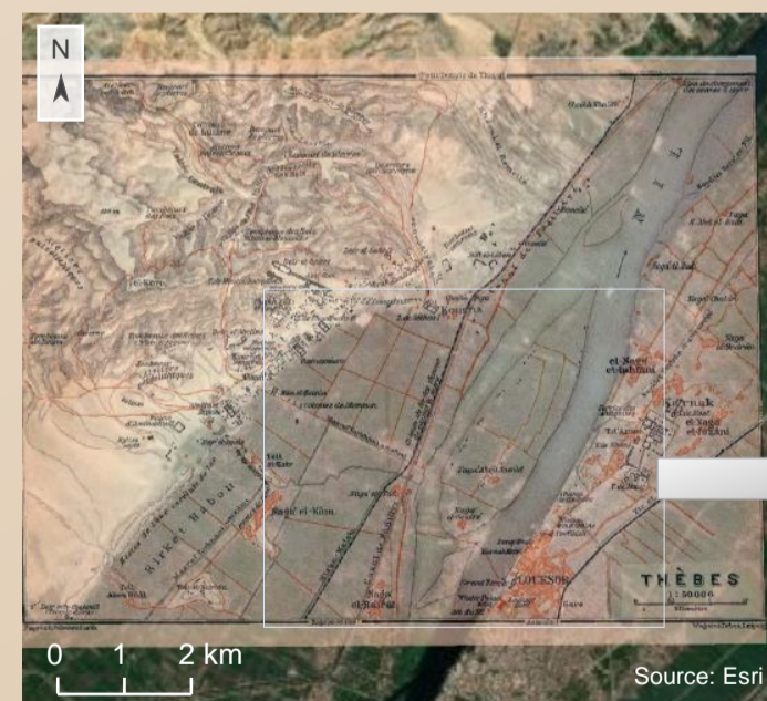
Figure 3. G. Schweinfurth, 1914. Georeferencing a topographical map.

Remarks: changements in the number and size of the islands, rationalisation of the flood plain.