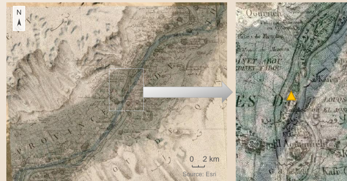
Legend: ▲ Island of Bayrat

• The analysis of the available cartography of the region proves to be decisive to better understand the anthropic and geomorphological changes that occurred in the alluvial plain and to establish how quickly the landscape has changed and still evolves.