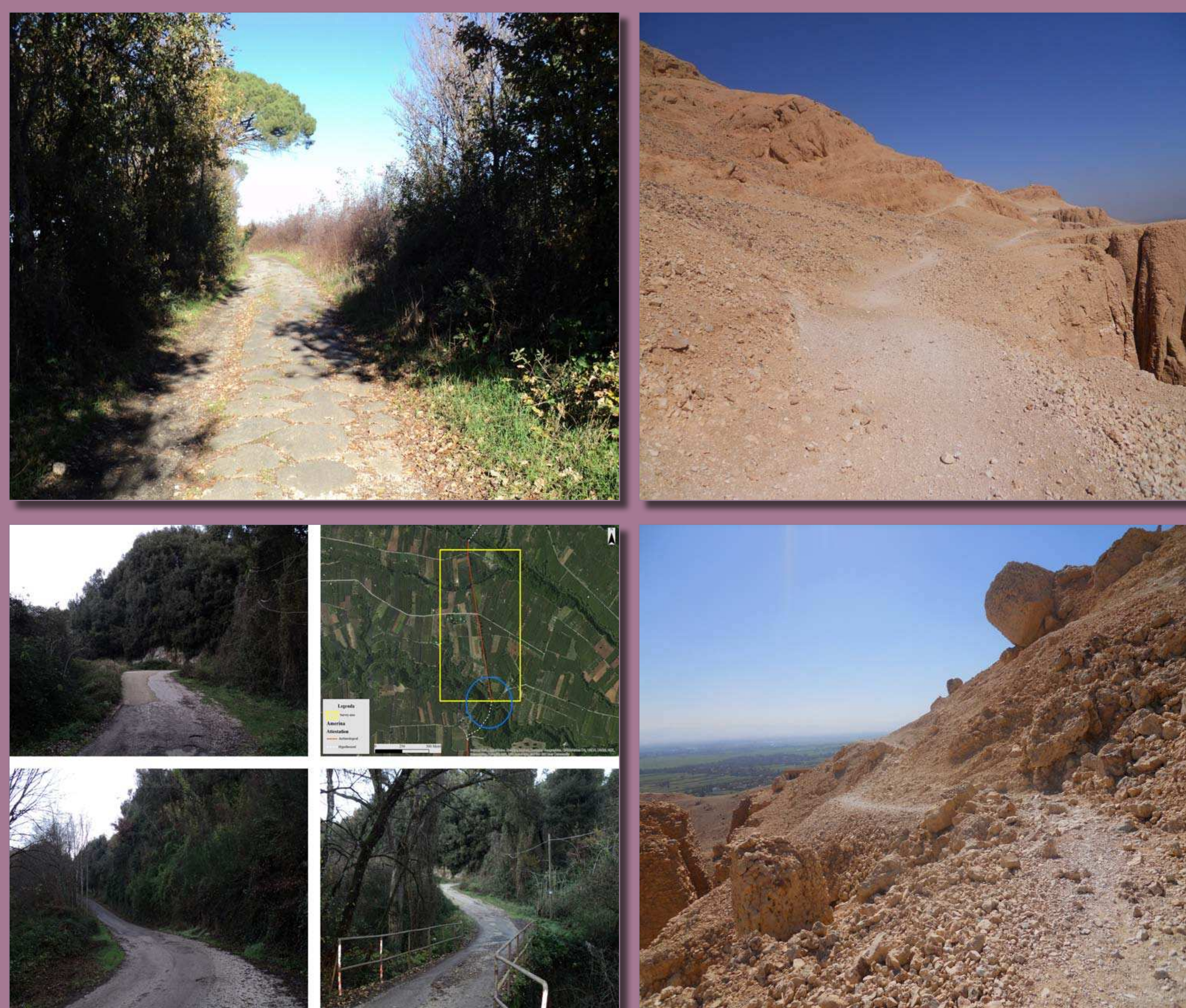
Some pictures taken during the field survey. In upper left the via Cassia close Risieri, in the upper and bottom right a stretch of the historical path between Deir El Medina and King's valley. In the two images we can observe the many slope changes along the way. In the bottom left we offer an example of a ravine crossing along the Amerina path. As we can see in the photo, the modern road still pass in this point.

During the field survey we checked, first, the landscape morphology in relation to the historical paths direction. In this way we had a chance to verify the real environmental characteristics (slope, hydrography, soil's drain, etc.) used in the data elaboration process. After we controlled all critical parameters (for example: in the northern Lazio the chance to cross some ravines) evaluated in the cost surfaces.