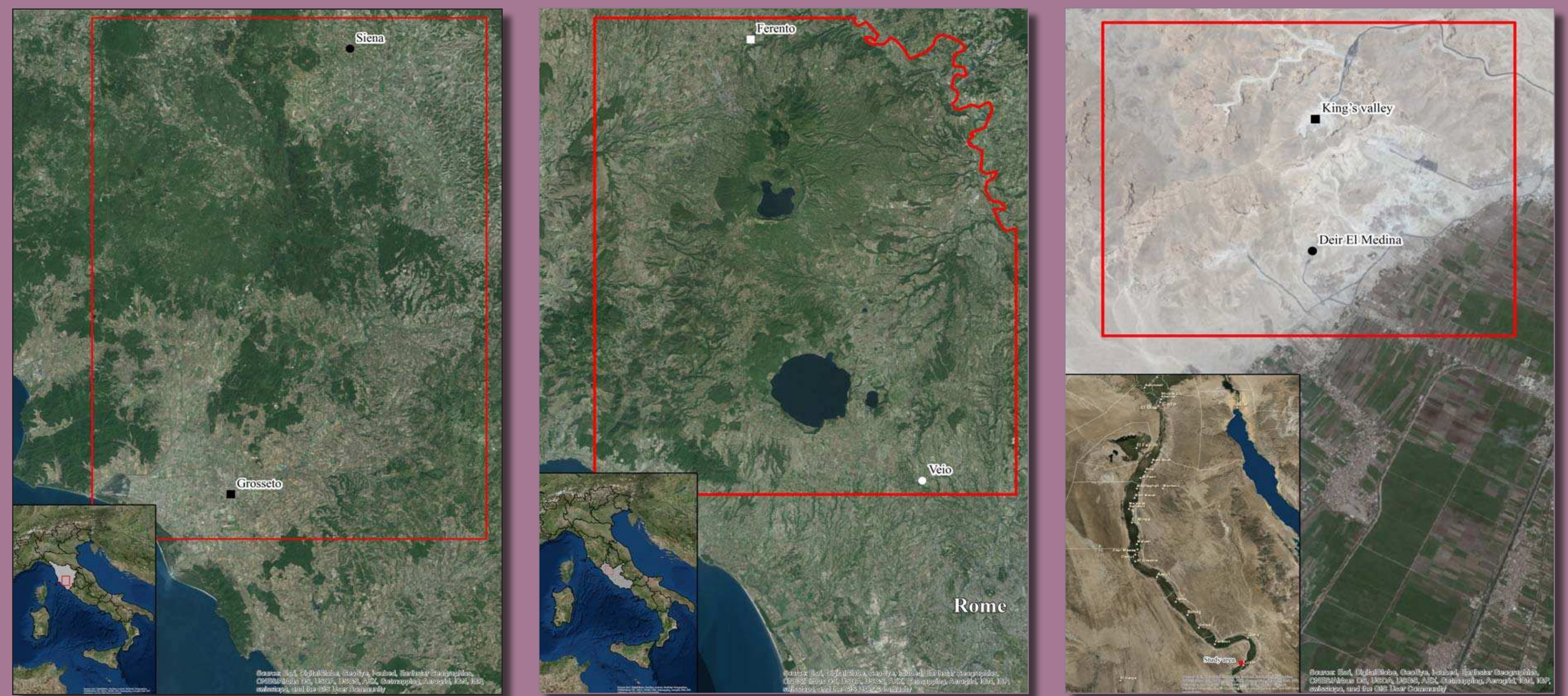
In these images we show the location and the extension of all the sample areas chosen in this research: on the left the south Tuscany, in the middle the northern Lazio and on the right the King's valley in Egypt (near to Luxor).

In this poster we wish to present the preliminary result of a three case of study focused each one on the predictive and postdictive approach to historical routes. We developed and tested the procedure in three different geographical areas: southern Tuscany, northern Lazio and the king's valley in Egypt. Our work consists of three main steps. The first one is predictive. We evaluated the movement in a given context and period. In this phase we produced several potential paths between two known settlements, by changing the weight of the environmental and cultural factors. In the second step we verified the forecast directly on the field. The fieldwork is a crucial step to get the necessary information to establish the reliability of the simulations processed. The last step is postdictive. We change the question and we ask why they used exactly those paths. In these case studies we integrated all the available data, including those obtained during the survey. We modelled several cumulative cost surfaces to produce a simulation that overlaps as much as possible the historical paths.