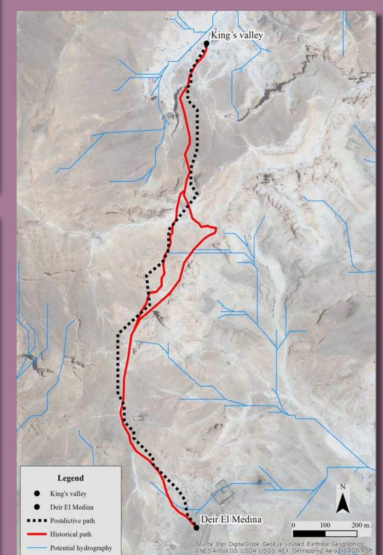
In Egypt we managed to elaborate a potential path that overlaps a 100% with the historical route used by the egyptians craftsman (see above). To produce this outcome we worked with the slope values, assigning a lesser weight to all the steepest slope.

In the last one step, the postdictive, we modelled the cost surface until when the computer does not produce a potential path that has a match equal to 50% with the historical route, within a 100 and 150 m buffer centred on the latter.