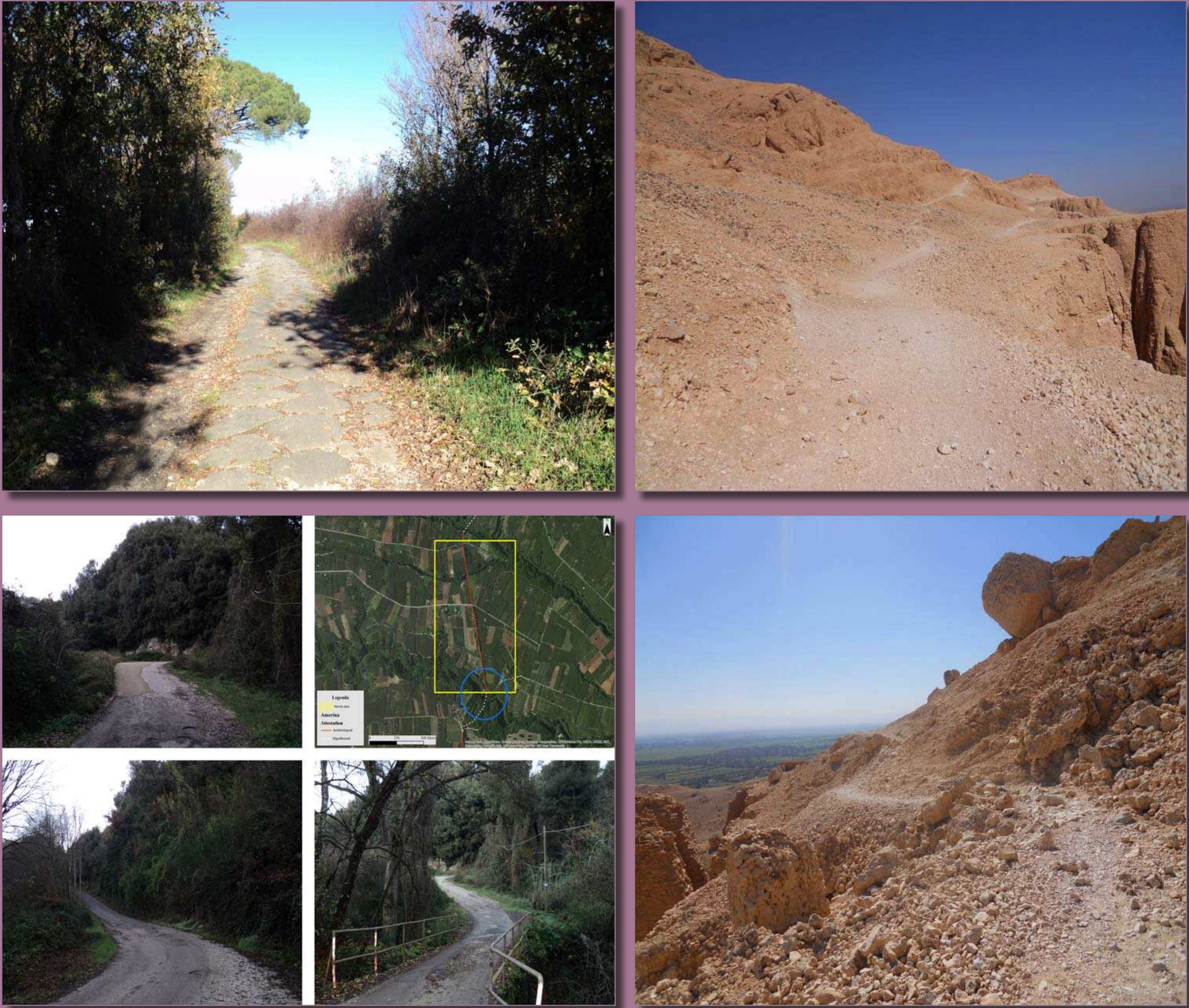
Some pictures taken during the field survey. In upper left the via Cassia close Risieri, in the upper and bottom right a stretch of the historical path between Deir El Medina and King's valley. In the two images we can observe the many slope changes along the way. In the bottom left we offer an example of a ravine crossing along the Amerina path. As we can see in the photo, the modern road still pass in this point.

During the field survey we checked, first, the landscape morphology in relation to the historical paths direction. In this way we had a chance to verify the real environmental characteristics (slope, hydrography, soil's drain, etc.) used in the data elaboration process. After we controlled all critical parameters (for example: in the northern Lazio the chance to cross some ravines) evaluated in the cost surfaces.