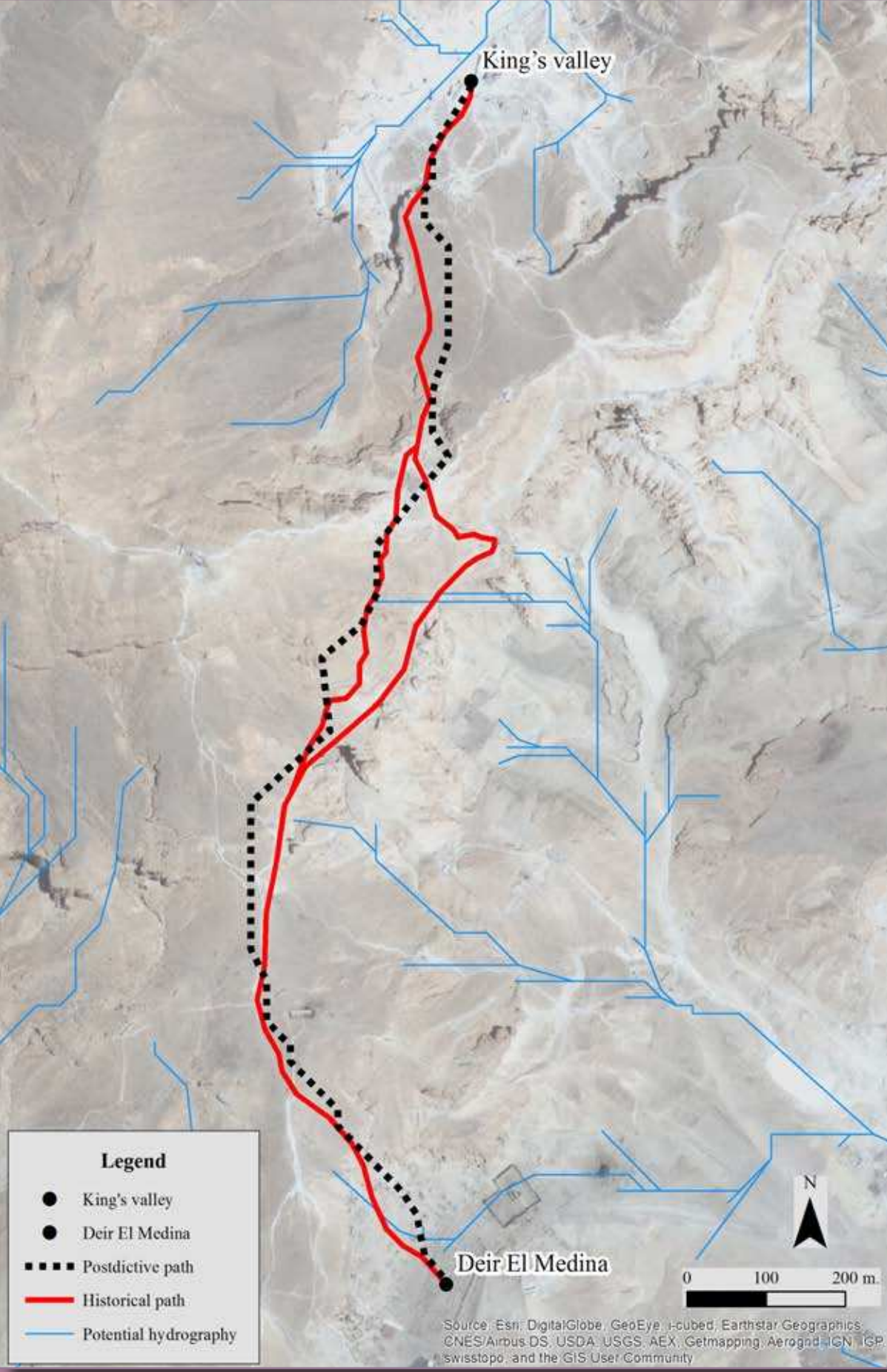
In Egypt we managed to elaborate a potential path that overlaps a 100% with the historical route used by the Egyptians craftsman (see above). To produce this outcome we worked with the slope values, assigning a lesser weight to all the steepest slope.

In the last one step, the postdictive, we modelled the cost surface until when the computer does not produce a potential path that has a match equal to 50% with the historical route, within a 100 and 150 m buffer centred on the latter.