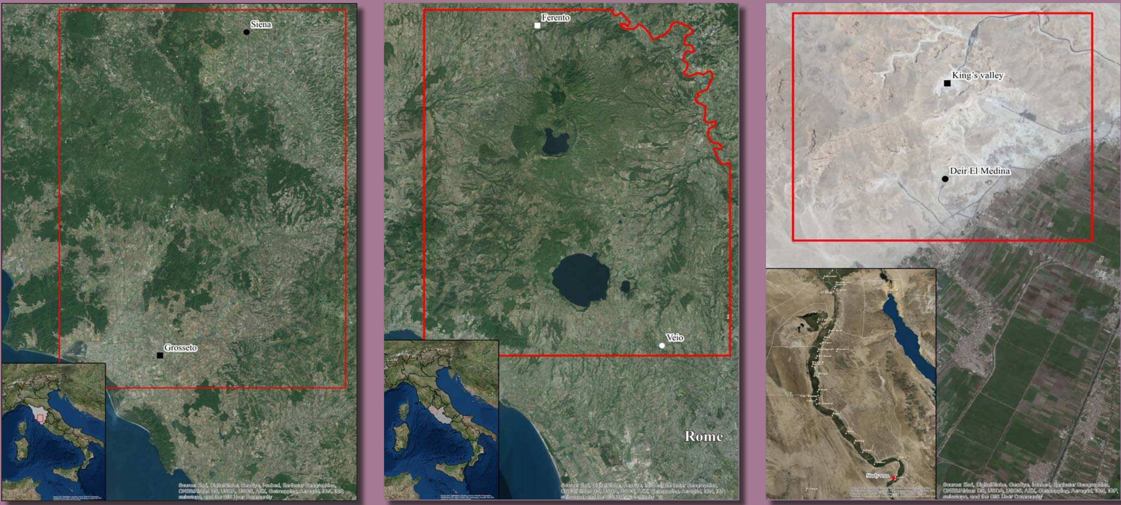
In these images we show the location and the extension of all the sample areas chosen in this research: on the left the south Tuscany, in the middle the northern Lazio and on the right the King's valley in Egypt (near to Luxor).

In this poster we wish to present the preliminary result of a three case of study focused each one on the predictive and postdictive approach to historical routes. We developed and tested the procedure in three different geographical areas: southern Tuscany, northern Lazio and the king's valley in Egypt. Our work consists of three main steps. The first one is predictive. We evaluated the movement in a given context and period. In this phase we produced several potential paths between two known settlements, by changing the weight of the environmental and cultural factors. In the second step we verified the forecast directly on the field. The fieldwork is a crucial step to get the necessary information to establish the reliability of the simulations processed. The last step is postdictive. We change the question and we ask why they used exactly those paths. In these case studies we integrated all the available data, including those obtained during the survey. We modelled several cumulative cost surfaces to produce a simulation that overlaps as much as possible the historical paths. Thus, we can understand and evaluate which were the key factors that constrained the routes network.