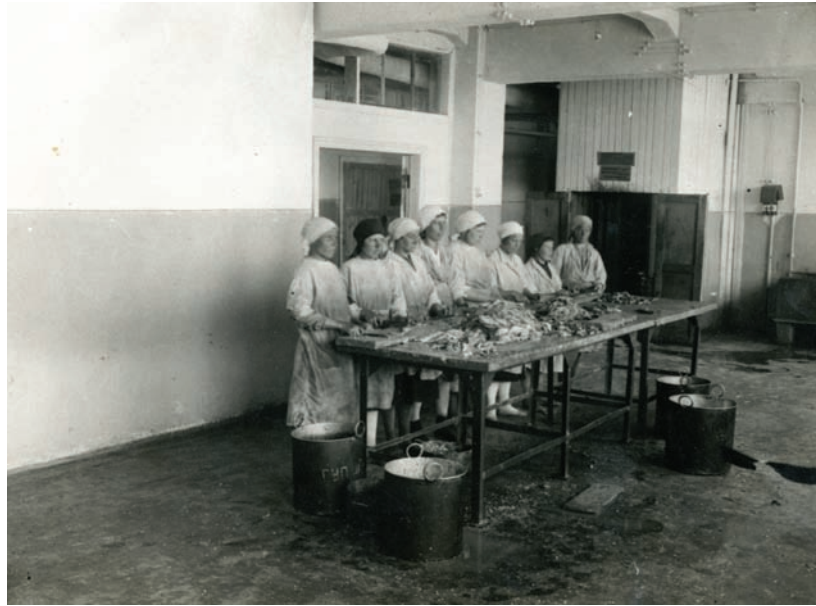
FIGURE 5: Preparation of poultry and meat for lunch at the industrial kitchen ( fabrika kuhnia ), 1932.