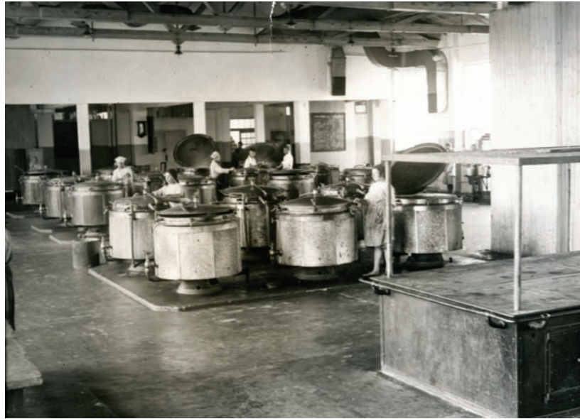
FIGURE 3: Soup cookware in the industrial kitchen ( fabrika kuhnia ), 1932.