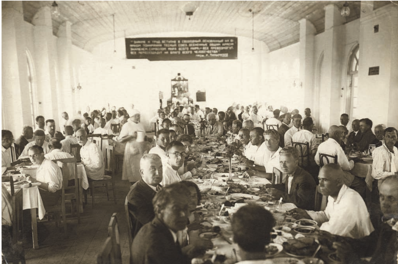
FIGURE 4: Gala dining for the opening of the factory, July 15, 1933.

steadily presented with a discourse of modernity where “the future of socialism was always conceived in terms of plenty” (Fitzpatrick 2003: 19), yet they had to eat monotonous, unhealthy, and often disgusting food. This discrepancy was bound to have political consequences. The Stalinist leaders were, however, fully aware of the political role played by the food served in the only spots where it was available in a hungry USSR. At least before 1935, central and regional authorities worked persistently toward merging discourse with reality in terms of food, but the results of their efforts proved unconvincing.