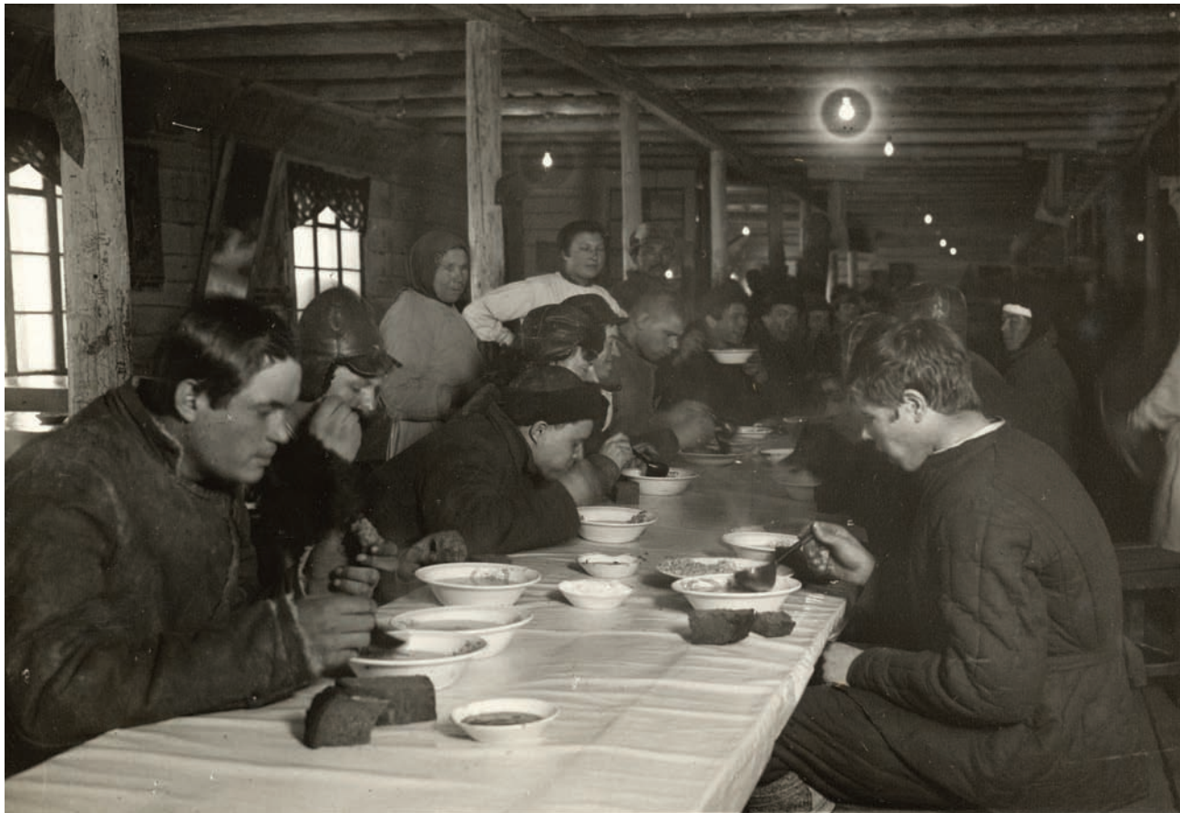
FIGURE 1: First canteen of the building site of Ural Machine Factory (Uralmach), 1928–29.

The Bolshevik policy clearly mimicked a broader European trend: collective dining halls had been built since the end of the nineteenth century, particularly during World War I (Gacon 2014). A similar trend can be seen in 1930s Britain (Long 2014) and in Fascist Italy (Ricciardi 2014), but nowhere did canteens acquire the same level of practical and ideological importance as in the USSR. To be sure, a similar mushrooming of canteens took place later in Communist China during the