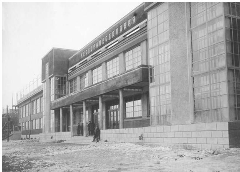
FIGURE 2: Building of the industrial kitchen ( fabrika kuhnia ), 1932.

I will argue that this study, at a very local level, of Soviet power in practice furthers our understanding of the Soviet system. As proposed by Melissa L. Caldwell (2009: 3), I took “food seriously as a starting point for exploring the political, economic, social, and cultural transformations.” Since Brillat-Savarin’s Physiologie du gout (1825), scholars have stressed the role played by food in the forming of identity (Bruegel and Laurioux 2002, among many others). Thinking of “the wooden spoon,” more than often used in Stalinist canteens, “and not