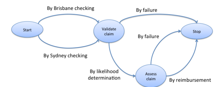
Fig. 2. The process model represented as intentional map.