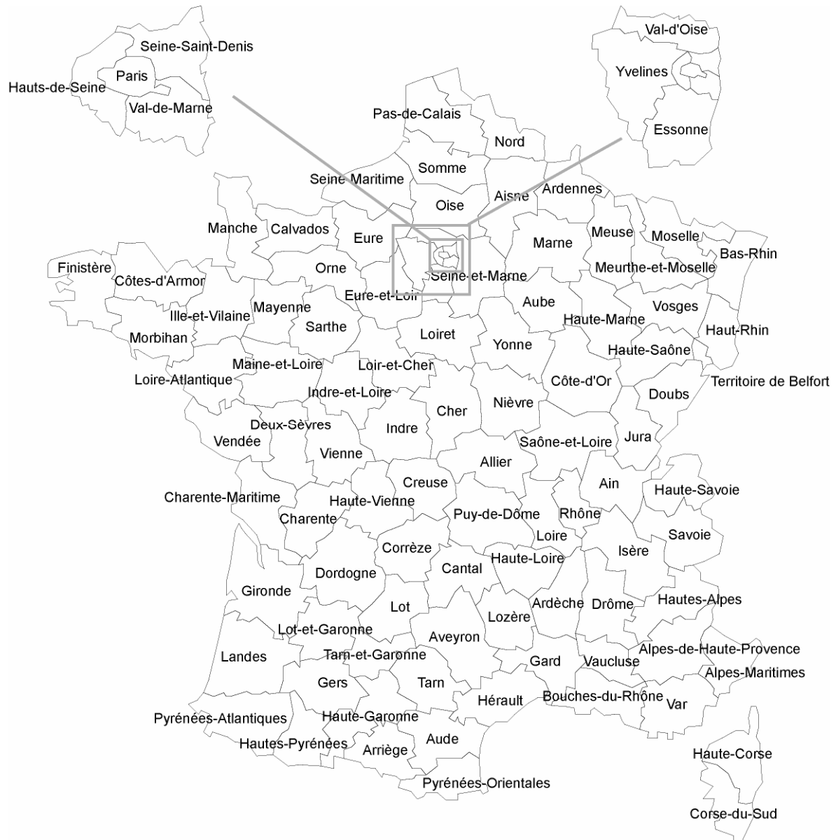
Figure 1: Map of the French départements